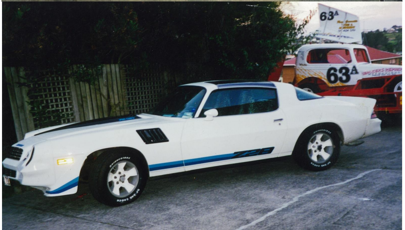
Top is my stockcar after I had it upgraded and below is my 1979 T Top Camaro, which I also loved, it was an awesome car, but, marriage complications forced a sale.