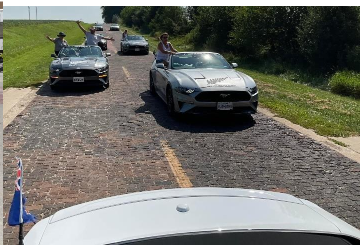
The original 9 foot cobbled road.