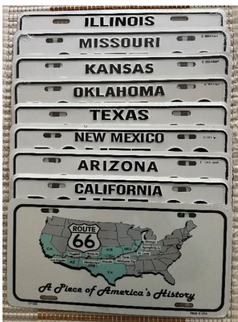
The 7 states of Route 66.