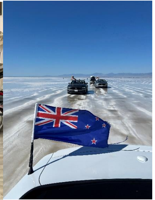
Bonneville Salt Lake