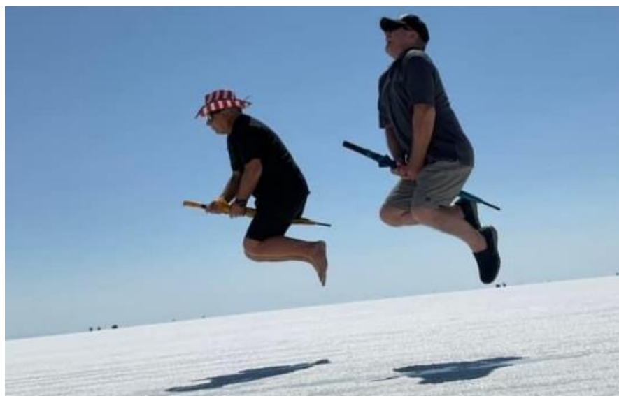
We can fly