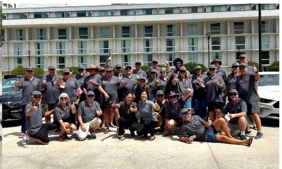
Ready to go, all transfers on.