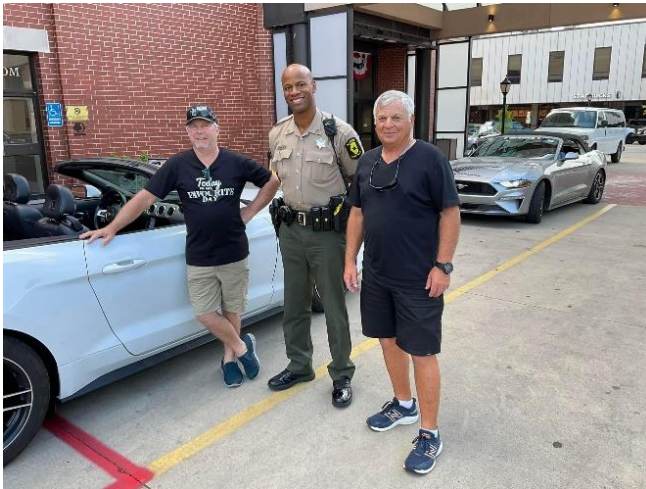
No Sir, we wouldn't do that!!!!