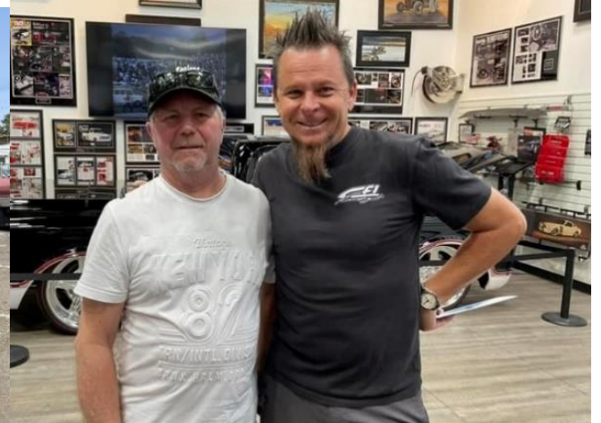
That will be $5000 please sir